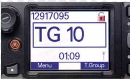
Standard Mode Screen