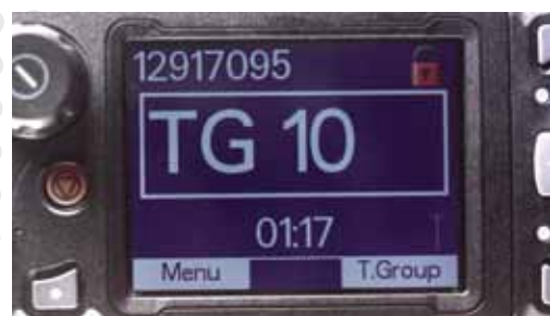
Night Mode Screen