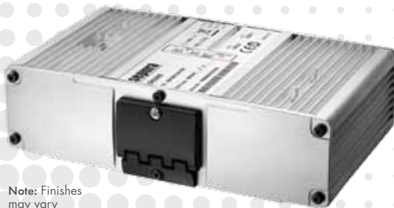
Note: Finishes may vary