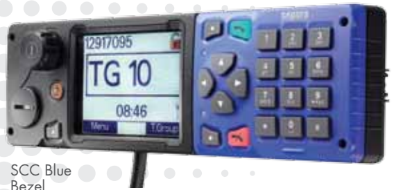
SCC Blue Bezel