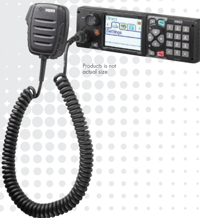
Products is not actual size