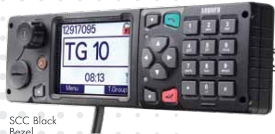
SCC Black Bezel