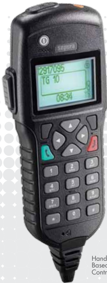
Handset Based Control